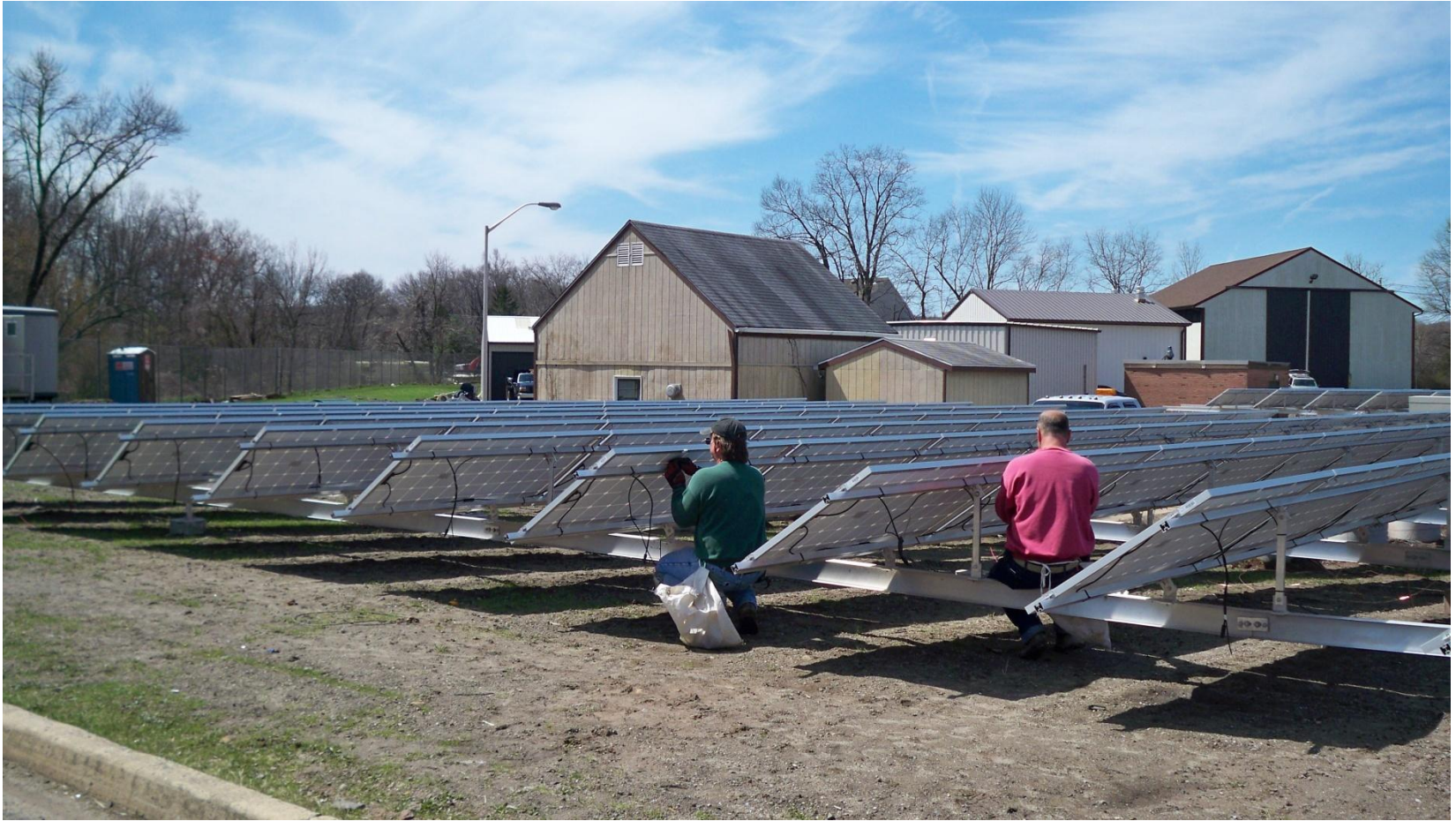
The Bernards Township Sewerage Authority has recently completed installation of solar panels at the treatment plant facility.