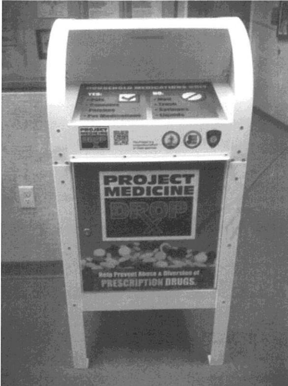
Permanent Drop Off at Bernards Township Police Department