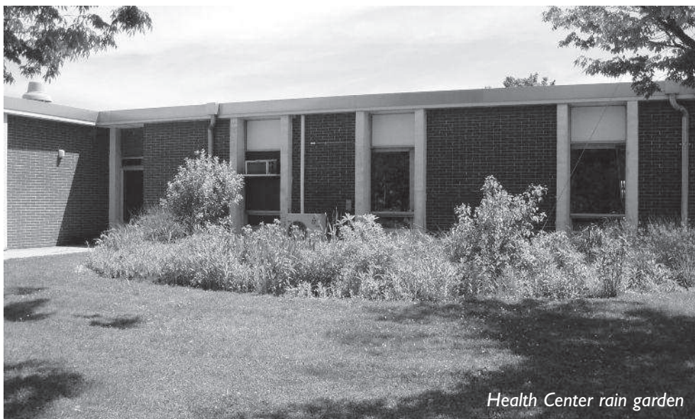
Health Center rain garden

So, Greenable Woodbridge and the New Jersey Agricultural Experiment Station of Rutgers University started with the installation of a rain garden outside the Woodbridge Township Health Center. The garden has since become a great source of pride to the Township and a showplace garden of effective rain garden design. And, more recently, students at Kennedy Park School #24 in Iselin created a rain garden in the park area next to the school.