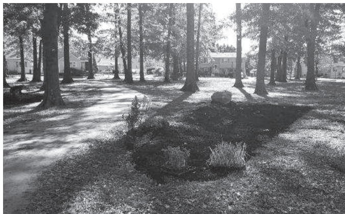
Kennedy Park School rain garden

With more than 44 inches of rainfall in New Jersey each year, 40 rain gardens in Woodbridge Township - each treating 1,000 square feet of driveway or rooftop runoff - would result in the recharge of more than one million gallons of water per year.